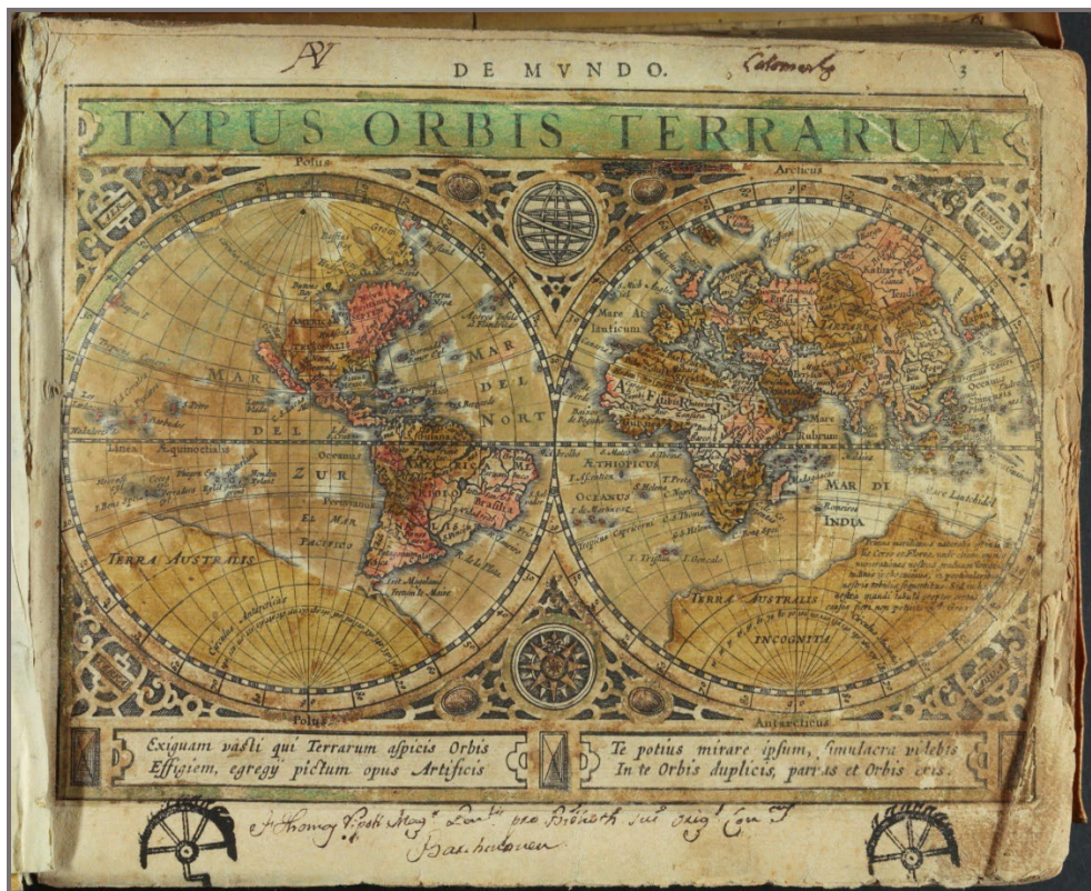
Mercator, Gerhard. Atlas minor . Amsterdam : Jan Jansson, 1634, p. 3

In this document, we want to detail in a Q & A format how Rare Book and Manuscript CRAI Library (University of Barcelona) organizes these stays, so that foreign professionals can consider whether they would be interested in joining us in the future.